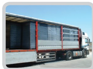
Stretch film also protects goods from dirt and dust.