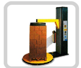
Stretch film application with a machine.