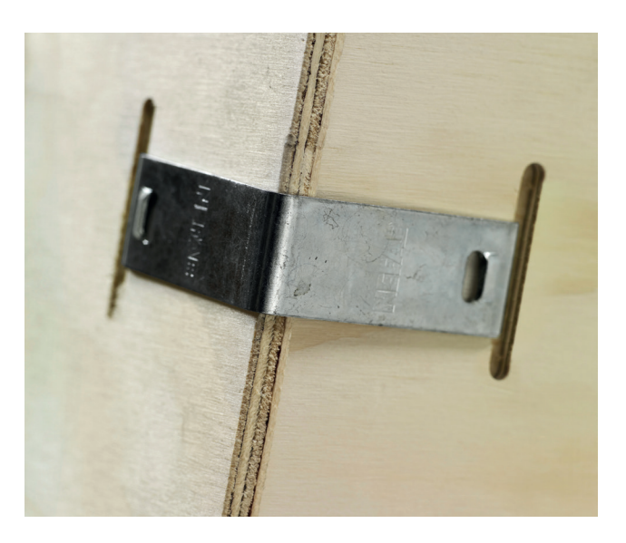
The packaging is held together with clamps, which are mounted without tools in the pre-cut grooves. The clamps are made of flexible sprung steel, so they don't pop off when the packaging is bumped or jolted. All that is needed for dismantling is a regular screwdriver; the clamp is designed to drop right into your hand rather than flying off and potentially hurting someone.