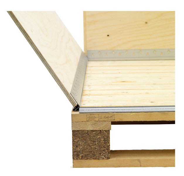
The side panels are mounted using a profile that is pressed into their lower edge. The panels can be mounted horizontally onto the base profile or be angled inwards up to 60°, reducing the need for a lot of space when packaging goods.