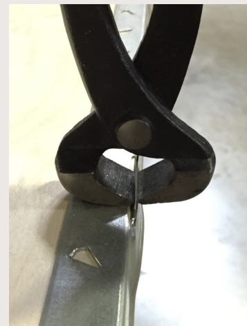
Step 4: The tongue should be vertical and free of kinks, so that it does not catch on the profile slot when the lid is removed.