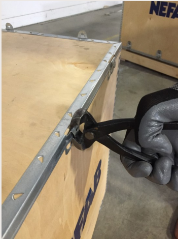
Step 1: Insert the Pincer "teeth" into the tongue slot in the profile. Pull to open up the profile tongue slot.