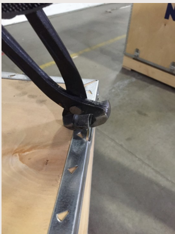
Step 3: Straighten tongue by pulling and sliding Pincer "teeth" upwards over the tongue.