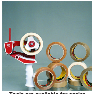
Tools are available for easier application.