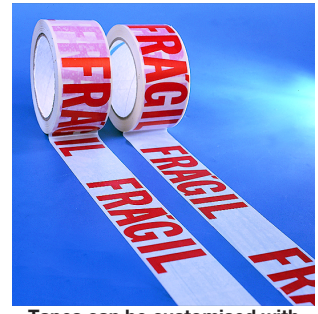
Tapes can be customised with printings.