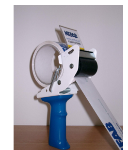
Tool for easier application.