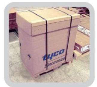
Steel strap application.