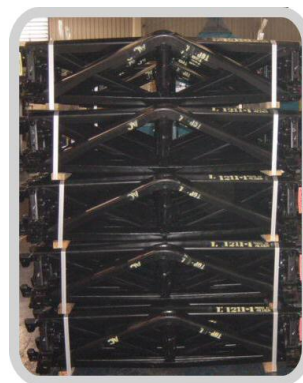
Textile strap application.